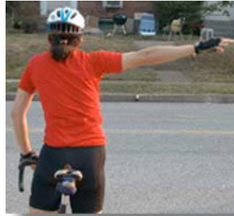
Also means right turn

Now that you've learned those hand signals, we'd like to give you a big thumbs-up for finding out more about bike safety!